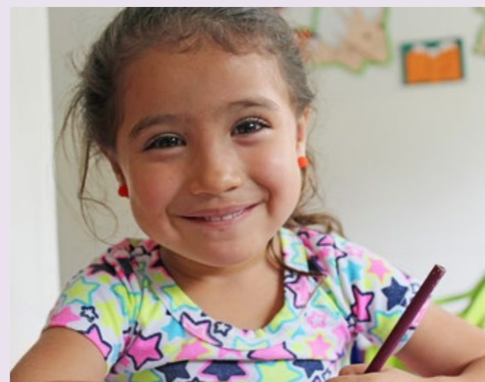
This picture comes from the worldwide programme work of SOS Children's Villages and serves to illustrate the day care centre in Spain.